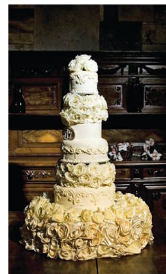
BED OF ROSES Custom cake stand by Edge Design Group.