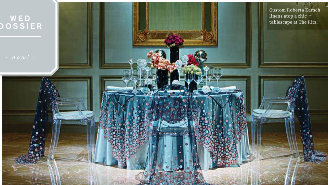
Custom Roberta Karsch linens atop a chic tablescape at The Ritz.