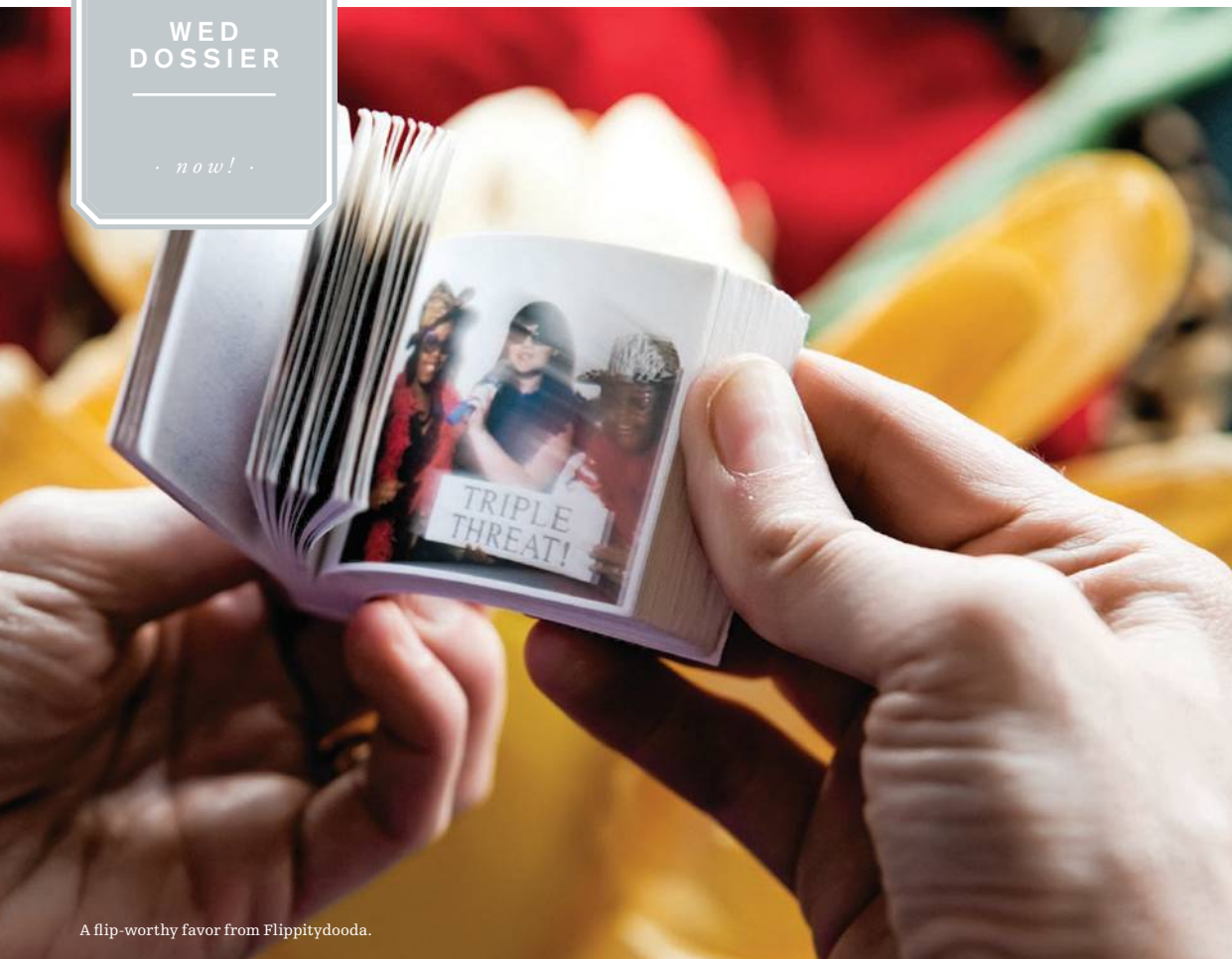
A flip-worthy favor from Flippitydooda.